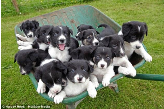
6. A ..... of pups