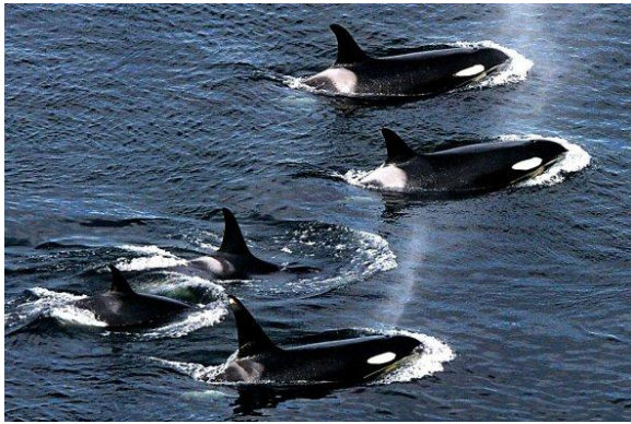
7. A ..... of whales